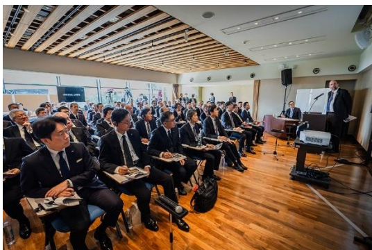
List of Tateshina Meeting Subcommittee Participants

*1 Link: https://global.toyota/en/newsroom/corporate/39544702.html